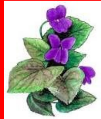
The Delta Connection Staff