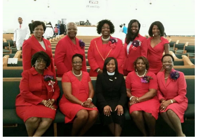
Members of Hinesville Alumnae attended worship service at Mt. Zion Baptist Church as part of May Week 2015.