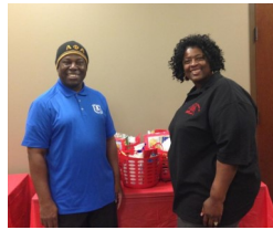
Scenes (above) from Homeless Coalition presentation. See story on page 9.