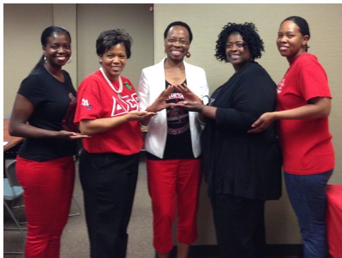
Sorors in attendance at the Economic Development Workshop