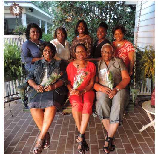
Sorors with Delta Dears after a delicious dinner.