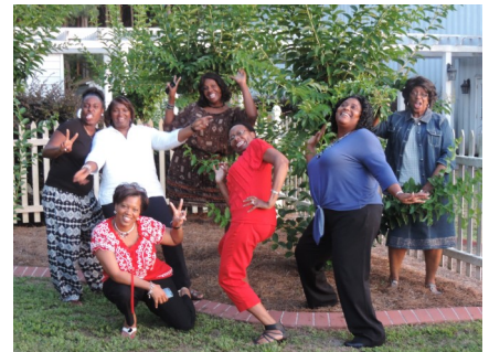
Hinesville Alumnae Fun shot!