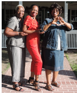
Delta Dears enjoying our outing!