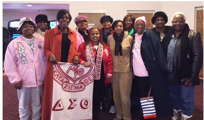
Delta Sigma Theta and Alpha Kappa Alpha sisters gather for a group picture after viewing Selma, January 8, 2015.