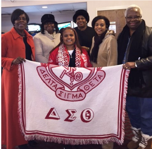
Delta's after the movie viewing of Selma