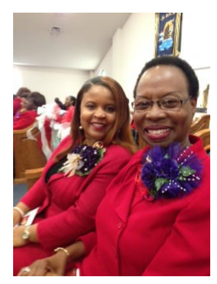
Sorors attending Albany Georgia Alumnae Founders Day