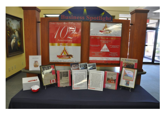
Hinesville Alumnae featured as "Business of the Week" at Ameris Bank