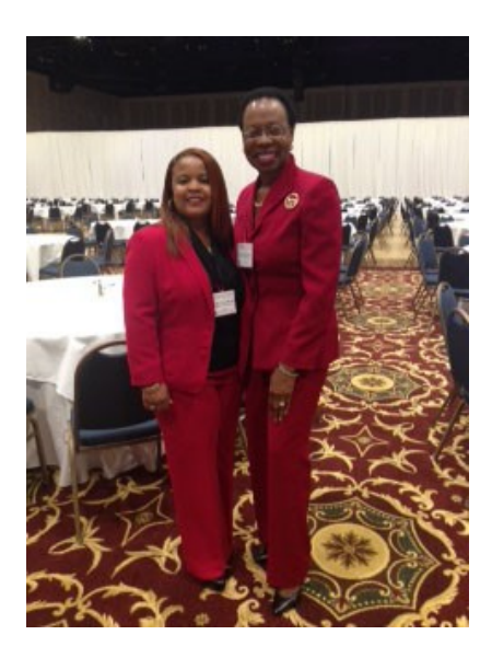
Sorors attending Georgia State Cluster