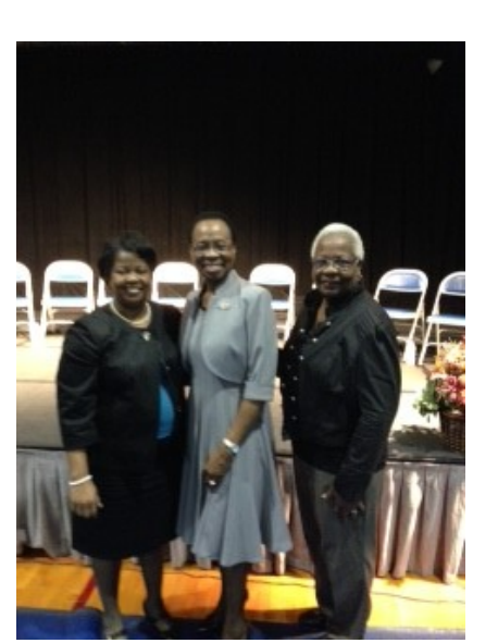
Sorors in attendance at the NAACP Community Policing Forum