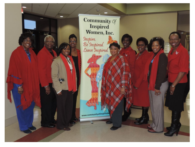
Sorors attending Community of Inspired Women, Inc Heart Health Month Celebration